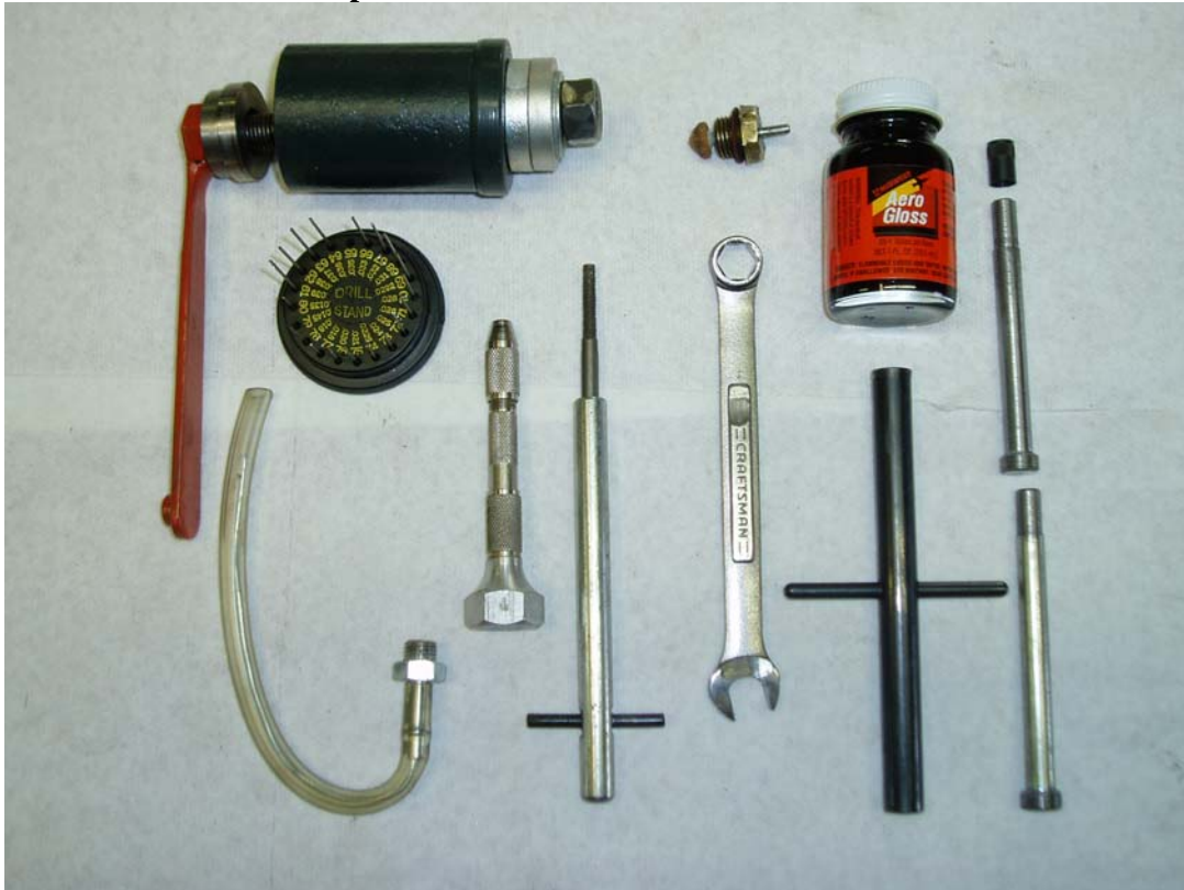
Puller for removing a "stuck" Zenith venturi from the top or bottom casting.